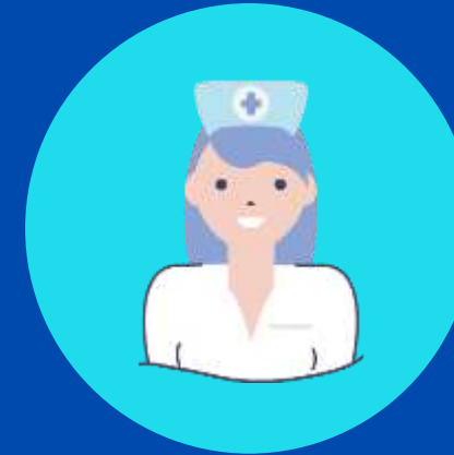
In Person Care